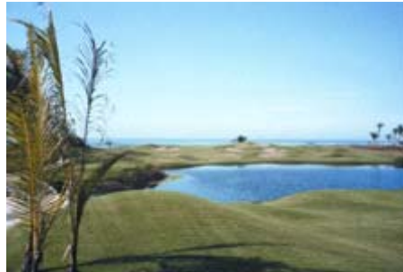
Set a New Course