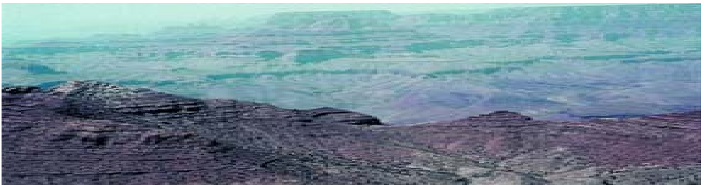
Explore New Horizons